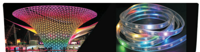
Flexible LED string