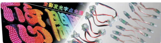
Spot light for advertsing